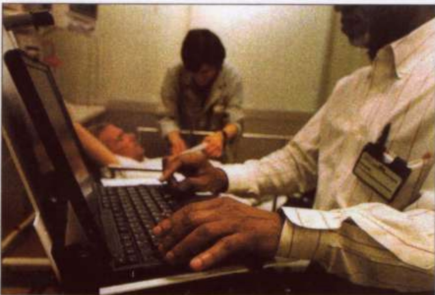
LOGGING IN. The admitting department comes to the patient's bed, even in an ER.

Unhappily, she will soon receive the one hospital item that Northwestern Memo-